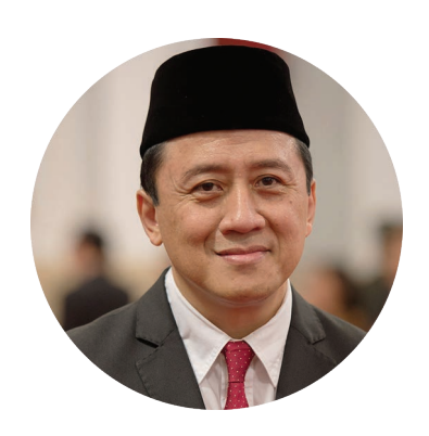
Triawan Munaf Chairman of Indonesia Creative Economy Agency

"Tourism growth in Indonesia is one of the best in the world and among the top 20 fastest growing Asian tourist destination."