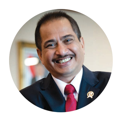
Arief Yahya Indonesia Tourism Ministry

"While now million of Indonesian people are joining the middle class, I believe there are two sectors that will encourage economic growth, namely tourism & lifestyle industry."